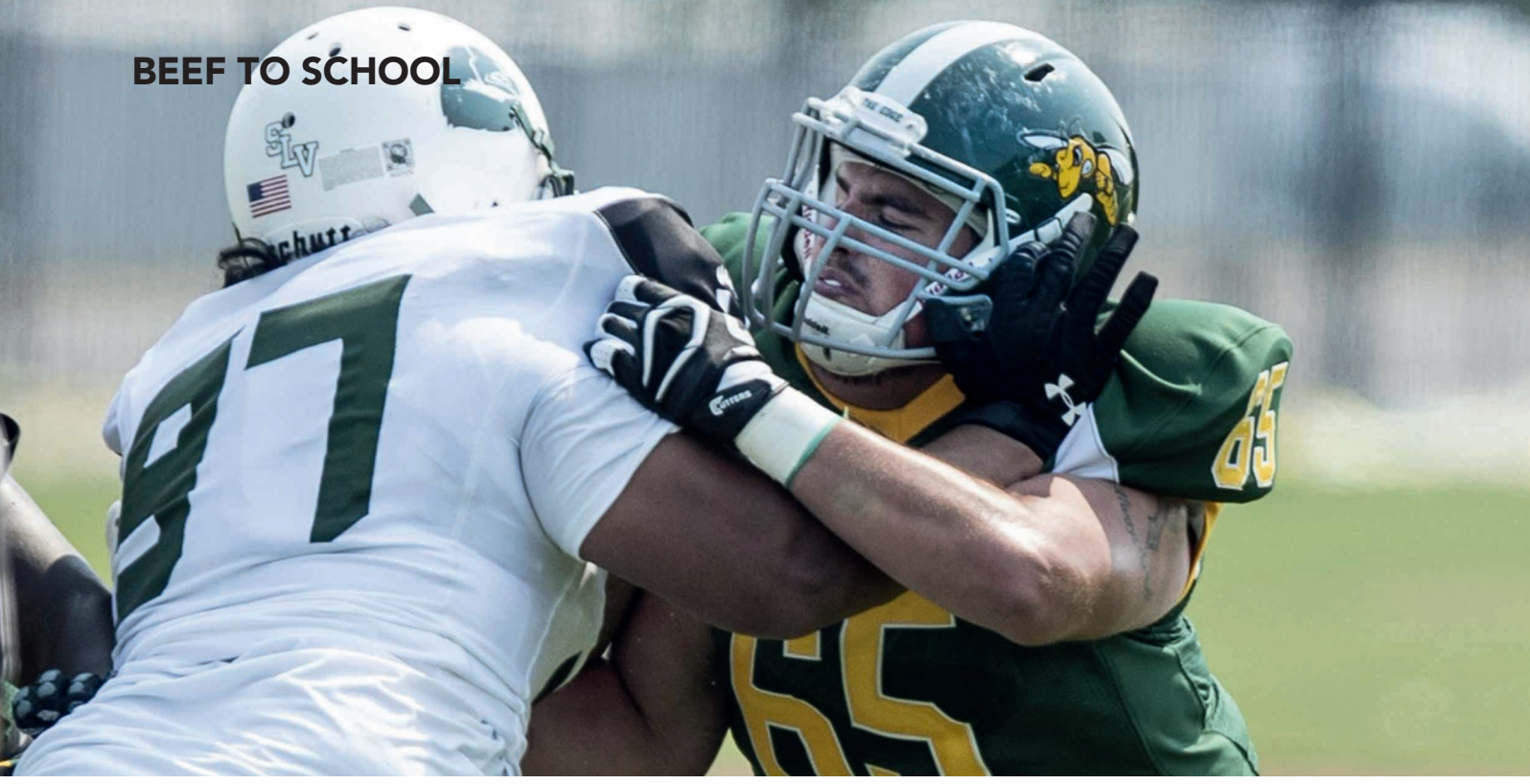
Black Hills State University is one of four higher ed institutions to adopt the Build Your Base with Beef program.