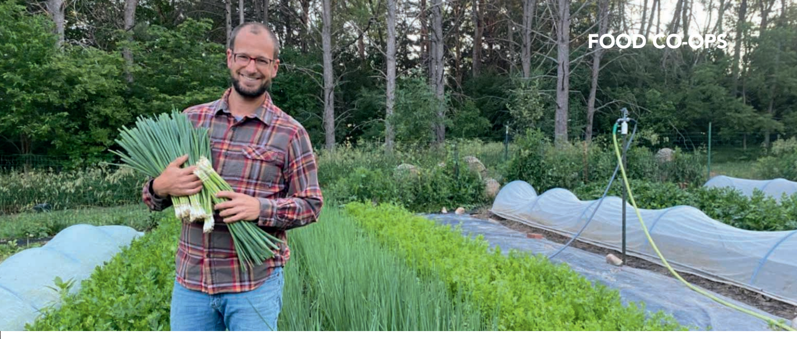
Caselli's Garden is among a growing list of fresh food suppliers for Dakota Community Market.

is designed to provide financing to help build the economic base of rural communities within East River Electric's regional service area. Hundreds of organizations, businesses, medical facilities, housing projects and many more have received financial support through the REED program over the past 20 years.