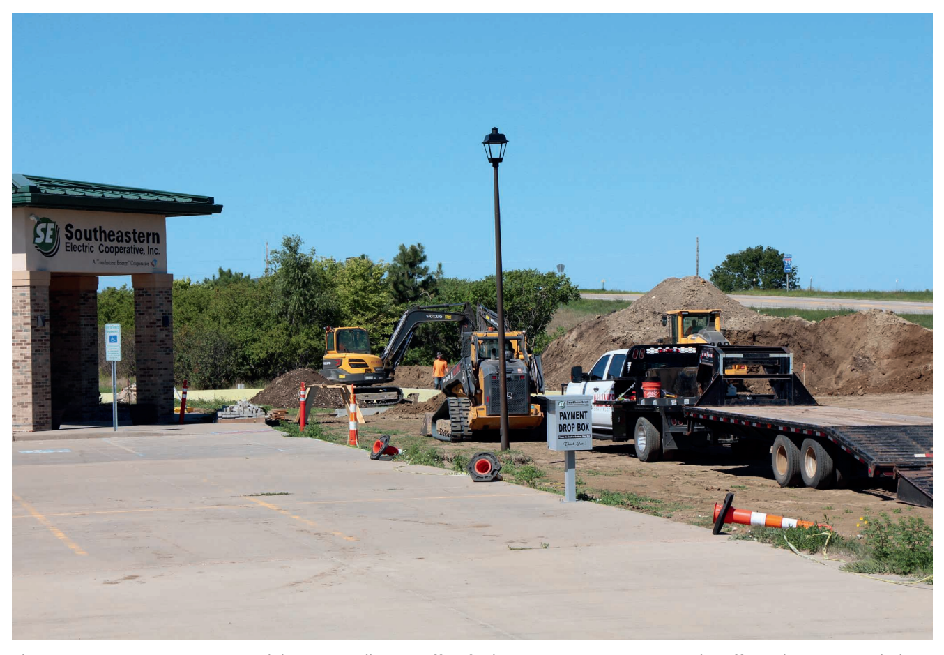
The construction project to expand the Sioux Falls area office facility is progressing on pace. The office is being expanded and upgraded to deliver better service to cooperative members as part of SEC's strategic planning process.

Progress is being made with the Sioux Falls area office expansion and addition.